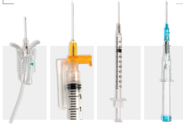
VanishPoint® Blood Collection Set