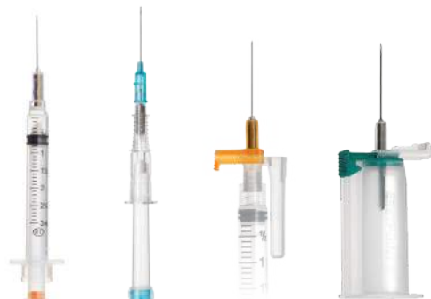
VanishPoint® Syringe VanishPoint® IV Catheter EasyPoint® Retractable Needle EasyPoint® Blood Collection Tube Holder with needle

To order these products, please contact rtisales@retractable.com