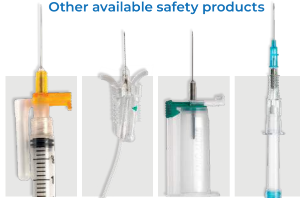
EasyPoint ® Needle